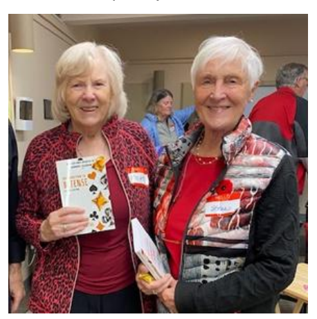
Top Flight A Pair: