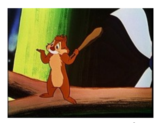
What happened, partner?

LESSON 3: Play each hand as if it is your first and have fun at the bridge table, but be wary of sneaky opponents.