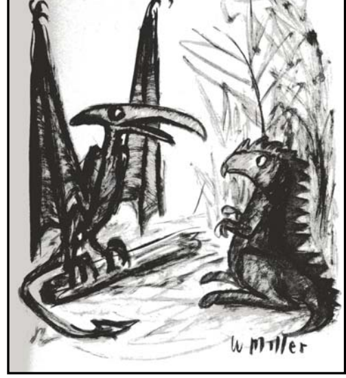
"What do you think he meant by, only dinosaurs play strong 2-bids?"