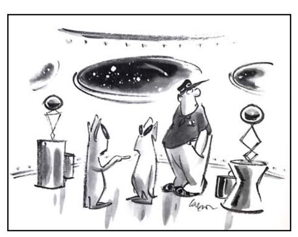
"He told me he was a world class bridge player. How did I know he was delusional?"