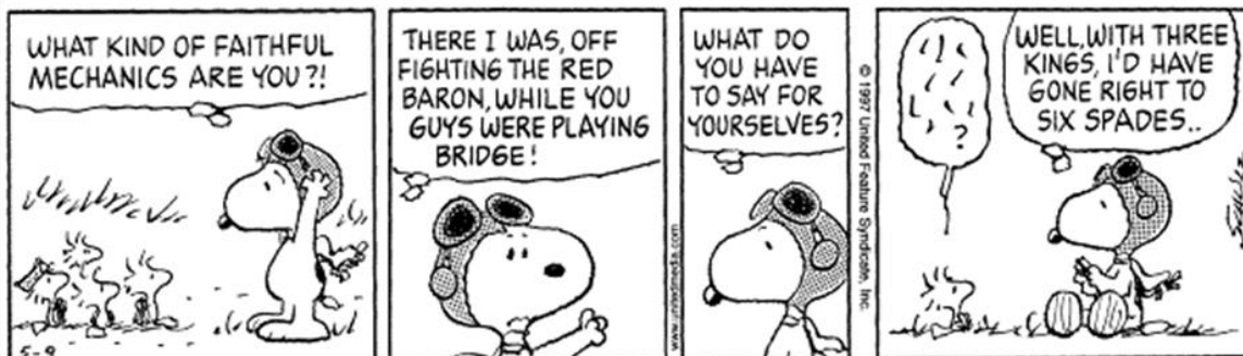
Charles M. Schulz

Source: Summer 2023 ACBL Management Report (Chicago)