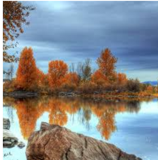
View from Caras Park, Missoula.